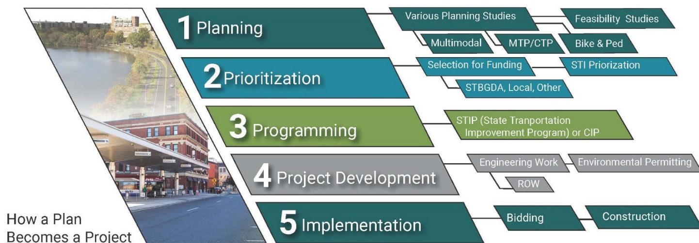
Figure 2: From Planning to Implementation

See Figure 2 below illustrating some of the generalized steps in the planning-to-implementation process. For a more detailed description of project development process in North Carolina, please refer to the latest NCDOT Integrated Project Delivery (IPD) guidance 1 .